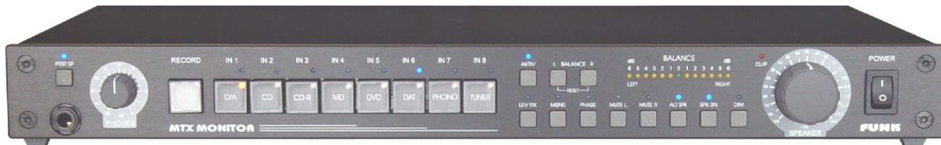
MTX-MONITOR.V3a, hi-fi version, black