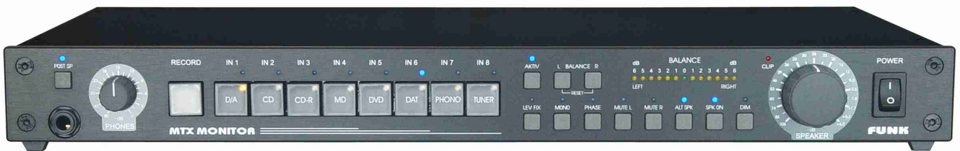
MTX-MONITOR.V3b-1, hi-fi version, black